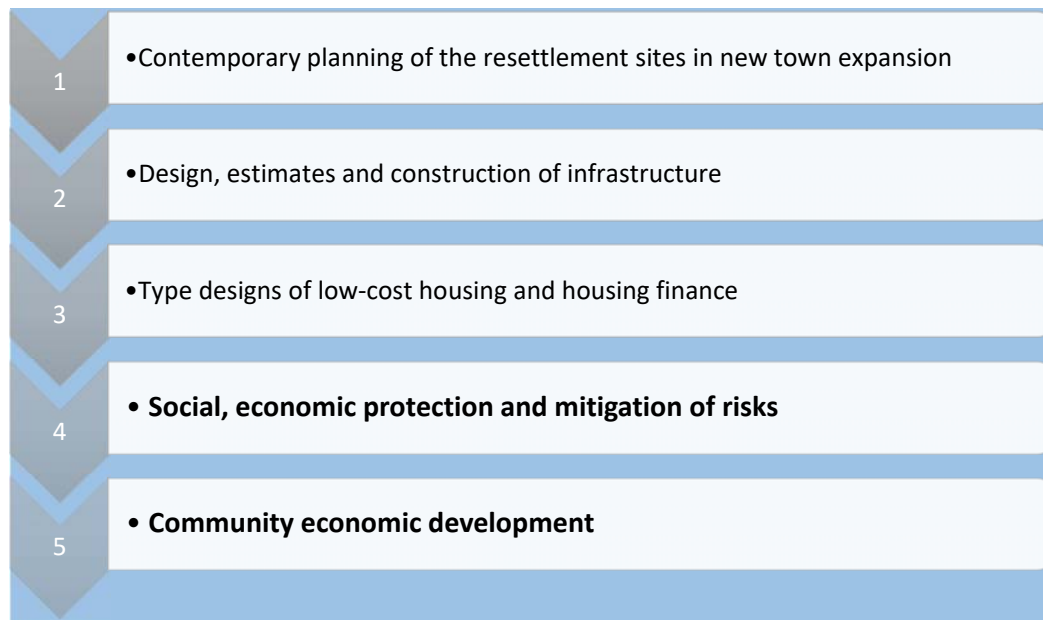
Figure 1: Five areas of Technical Assistance

Research undertaken during the inception phase will build on findings from UN-Habitat’s mapping assessment conducted in cooperation with YCDC that identified/verified 423 slum/informal settlements within municipal boundaries. The slum mapping classified informal settlements into seven typologies based on their location and/or development and qualitative socio-economic research on urban poverty and living conditions in Yangon’s informal settlements. 1